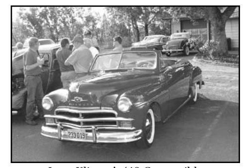
Jerry Klinger's '48 Convertible