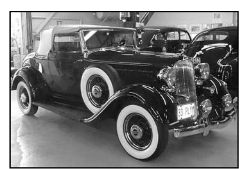
Tom Nachand's 33 PD Convertible Coupe