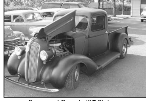
Raymond Dunn's '37 Pickup