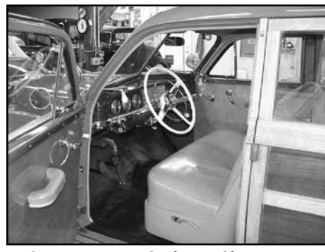
The enterior speaks for itself, very nice.